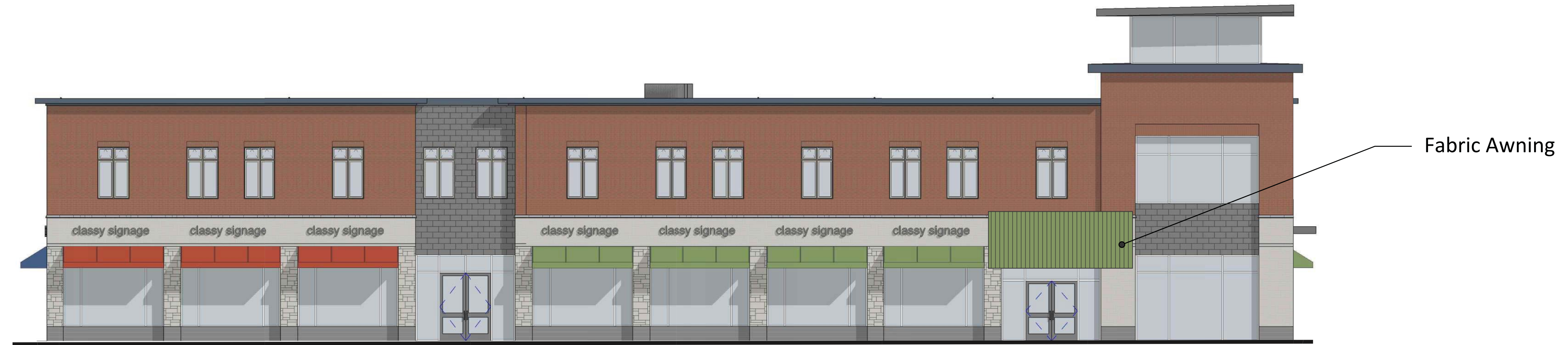
BUILDING A-1 NORTH